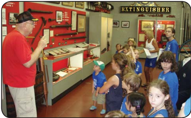
THE MUSEUM WELCOMED DOLLY'S NURSERY SCHOOL ON JULY 23RD FOR A TOUR.